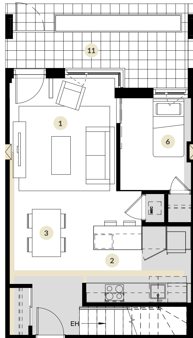
NIV. BAS / LOWER LEVEL