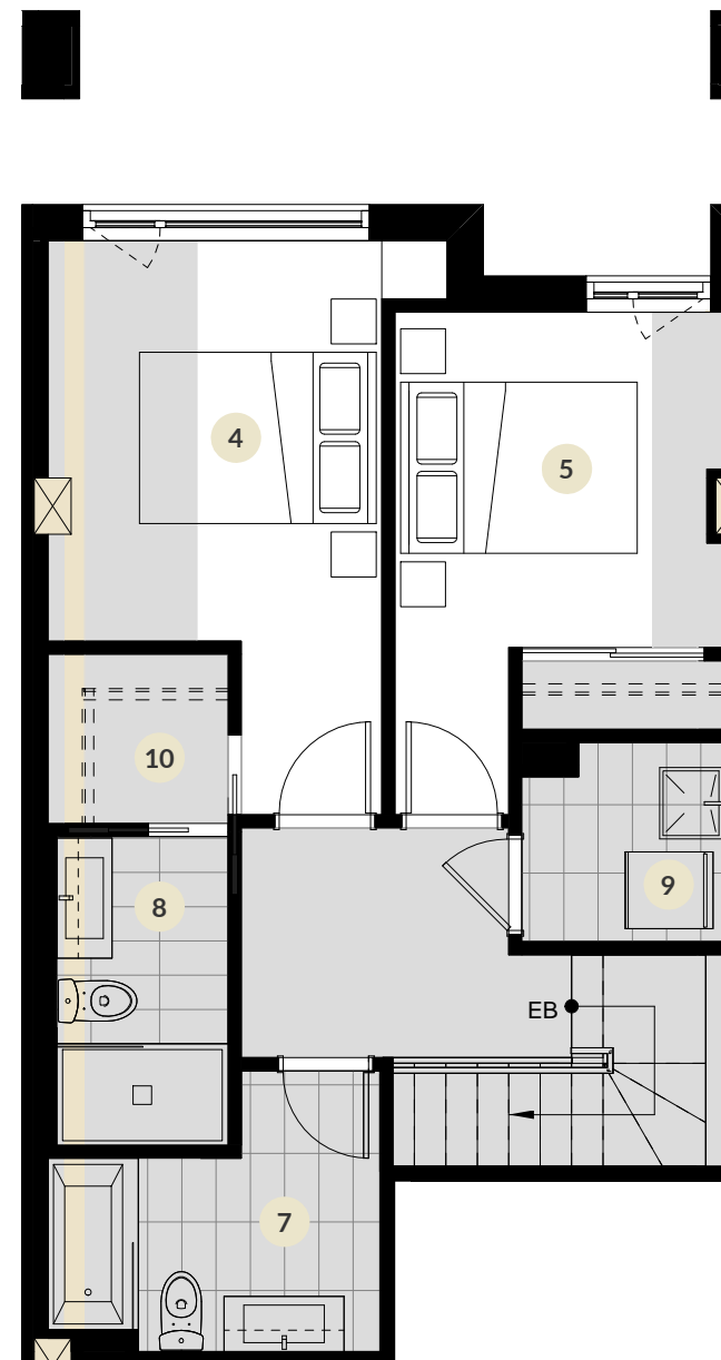
NIV. HAUT / UPPER LEVEL