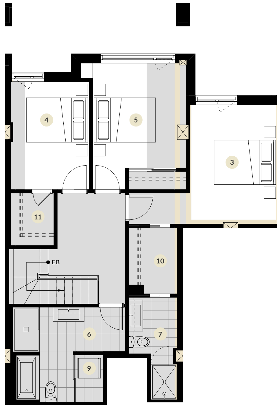
NIV. HAUT / UPPER LEVEL