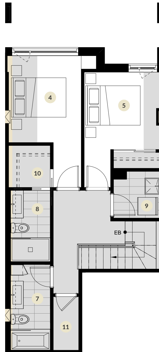
NIV. HAUT / UPPER LEVEL