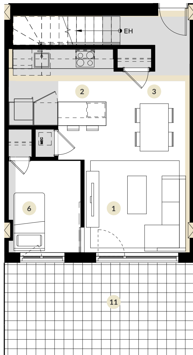
NIV. BAS / LOWER LEVEL