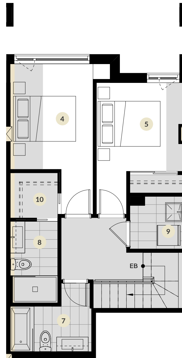
NIV. HAUT / UPPER LEVEL