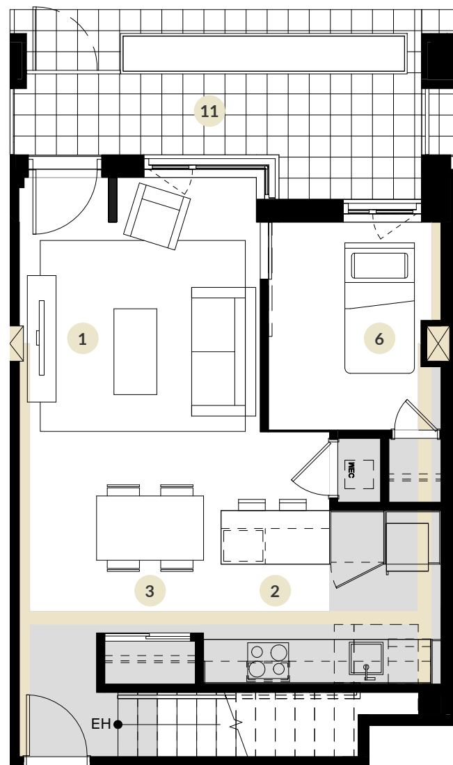
NIV. BAS / LOWER LEVEL