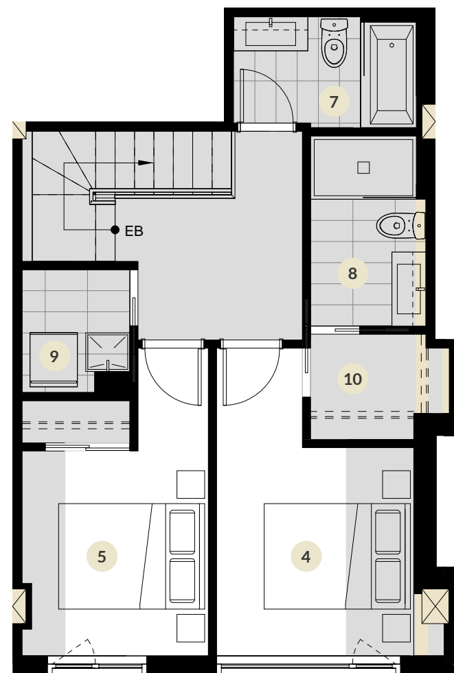
NIV. HAUT / UPPER LEVEL