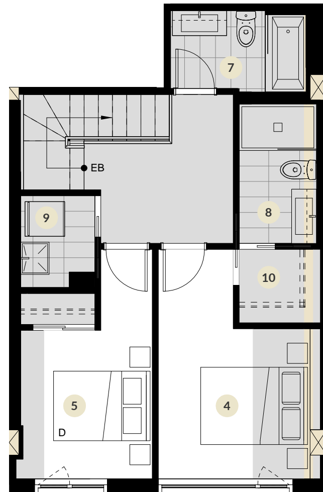
NIV. HAUT / UPPER LEVEL