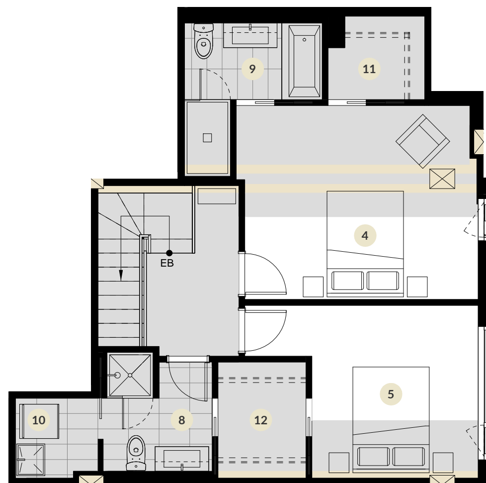
NIV. HAUT / UPPER LEVEL