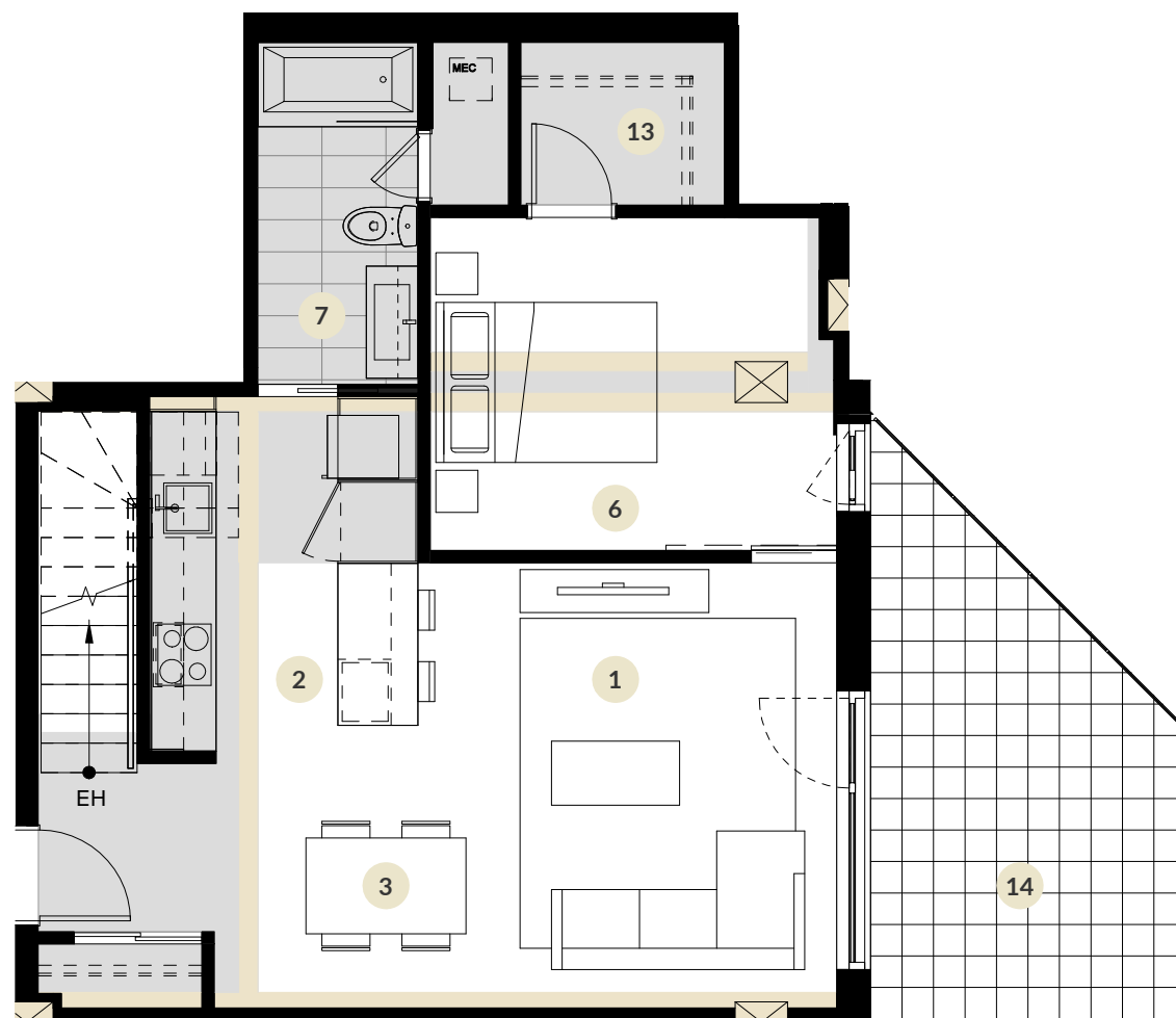
NIV. BAS / LOWER LEVEL