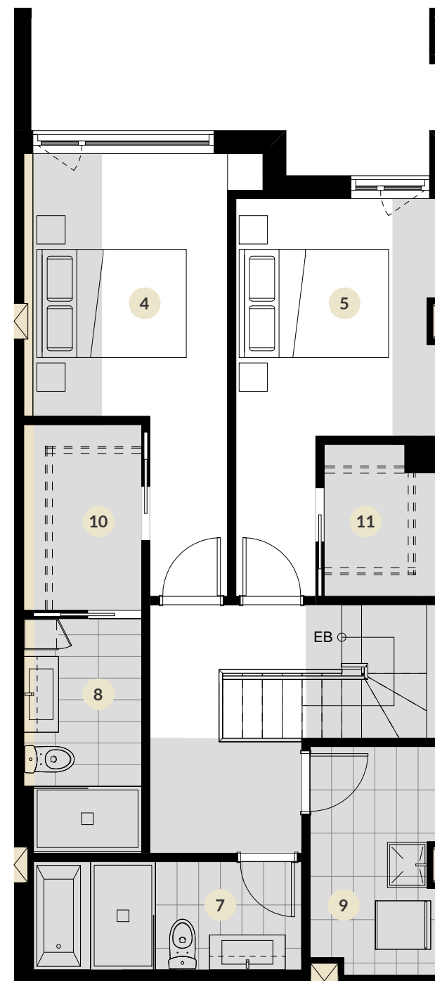
NIV. HAUT / UPPER LEVEL